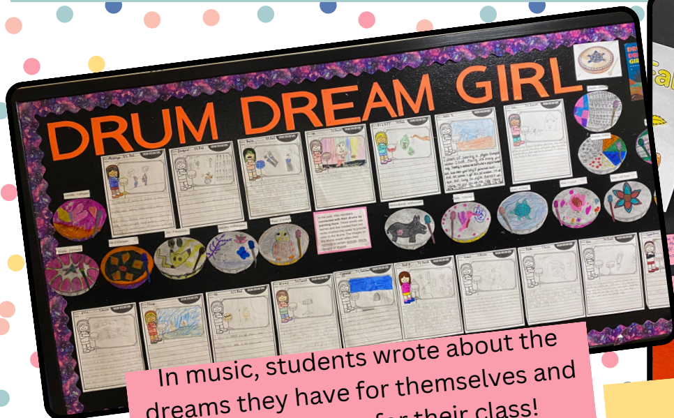
In music, students wrote about the dreams they have for themselves and designed a drum for their class!