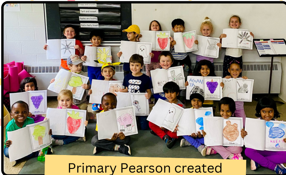
Primary Pearson created their own colour books!