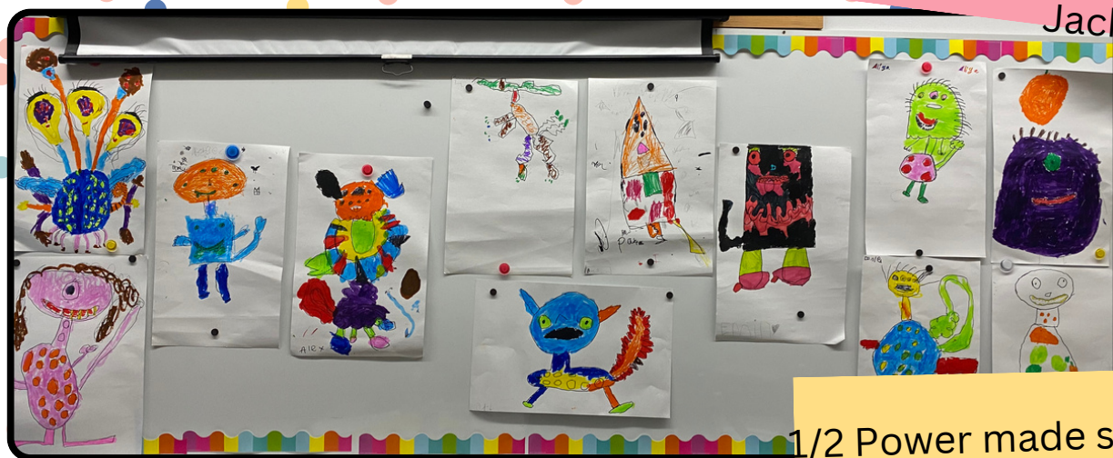
1/2 Power made some monster art!