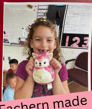
1 Lynch/MacEachern made "me bags"!