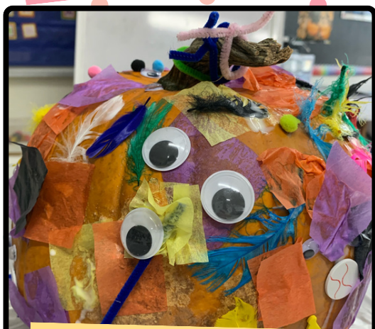
P/1 Mercer/Cornick created a pumpkin together!