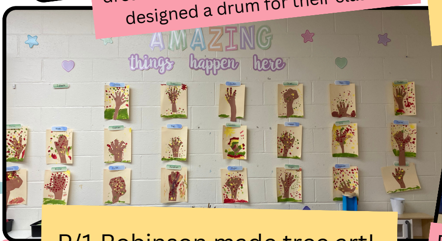
P/1 Robinson made tree art!