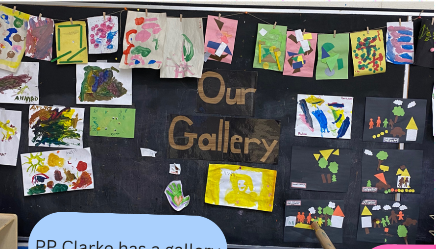
PP Clarke has a gallery wall full of art work!