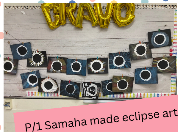
P/1 Samaha made eclipse art!