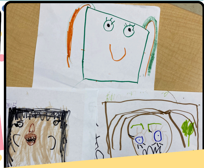
PP Clarke made self portraits!