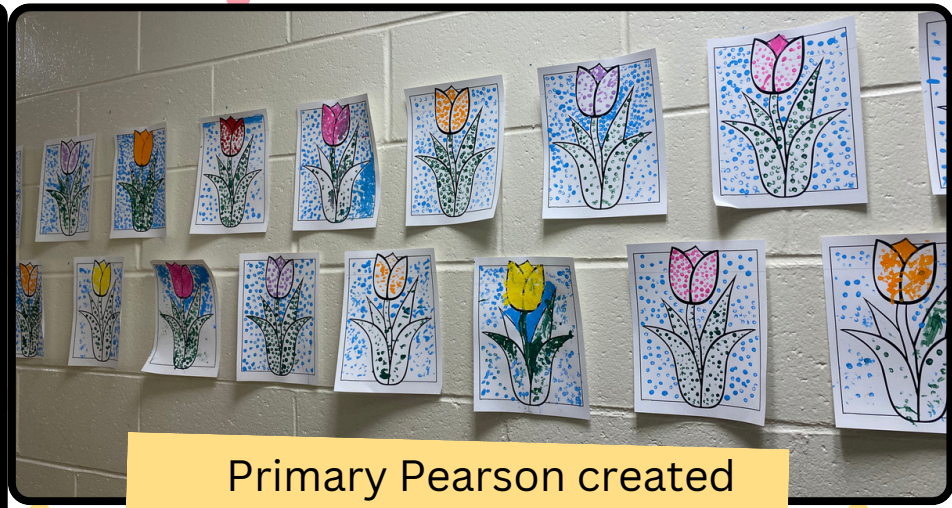
Primary Pearson created some flower art!