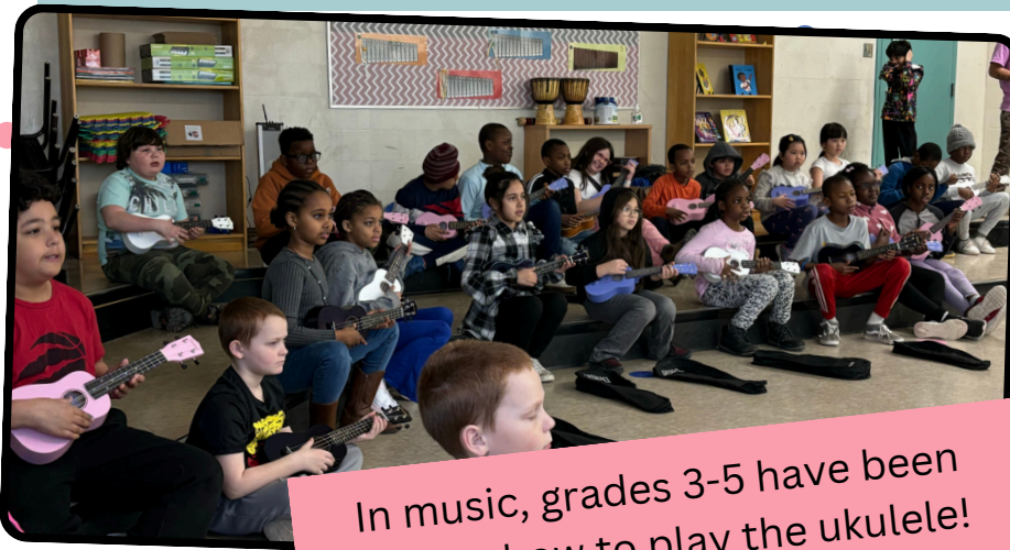
In music, grades 3-5 have been learning how to play the ukulele!