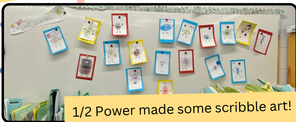
1/2 Power made some scribble art!